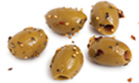
GOURMET RETAIL 240/480/720GR