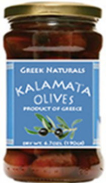
RETAIL PACKAGING 190/380/720GR