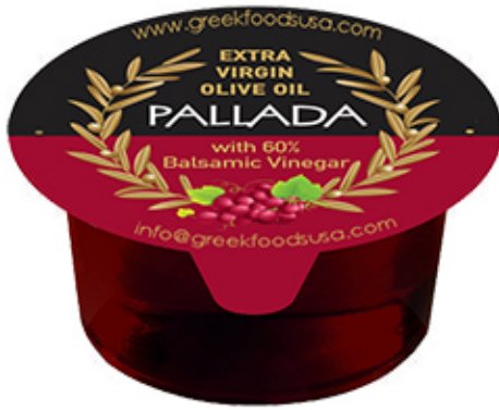
Aged Balsamic Vinegar w/ Extra Virgin Olive Oil 12 & 24ml

excellent quality - great natural taste - portion control