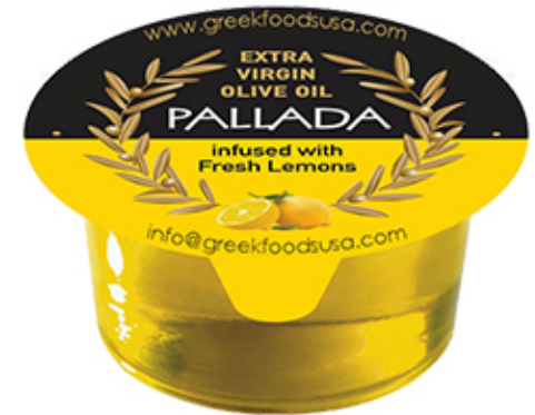
Extra Virgin Olive oil infused with Fresh Lemon 12 & 24ml