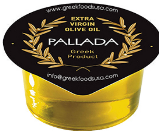
100% Extra Virgin Olive Oil 18ml